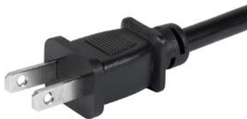
Power plug North America black