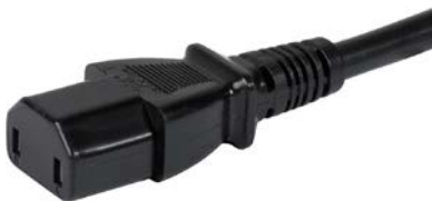
IEC Appliance Outlet C17 black