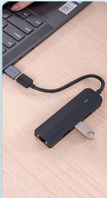
Laptop and USB splitter connection