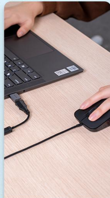
Laptop and mouse connection