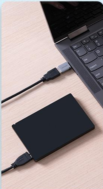
Laptop and hard disk connection