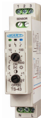
TWILIGHT SWITCH TS-43-4 ECO

In order to protect the environment, do not throw away used electrical appliances and electronics together with municipal waste. Used equipment should be delivered to collection points for recycling free of charge. Any information on this can be obtained at sellers, distributors, manufacturer or on the Internet. The product's packaging is made of ecological materials. The PVC packaging tape will be used while stocks last.