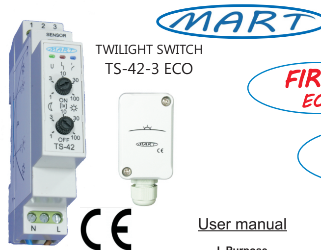
TWILIGHT SWITCH TS-42-3 ECO

In order to protect the environment, do not throw away used electrical appliances and electronics together with municipal waste. Used equipment should be delivered to collection points for recycling free of charge. Any information on this can be obtained at sellers, distributors, manufacturer or on the Internet. The product's packaging is made of ecological materials. The PVC packaging tape will be used while stocks last.