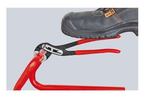
Self-locking on pipes and nuts: no slipping on the workpiece; the complete actuating force can be used to turn the workpieces; not having to squeeze the pliers handles reduces the required effort