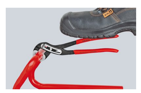
Self-locking on pipes and nuts: no slipping on the workpiece; the complete actuating force can be used to turn the workpieces; not having to squeeze the pliers handles reduces the required effort