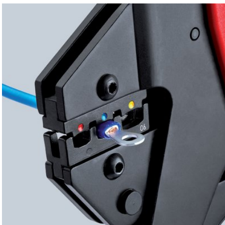
97 43 200 with crimping dies 97 49 06 for insulated terminals, plug connectors and butt connectors