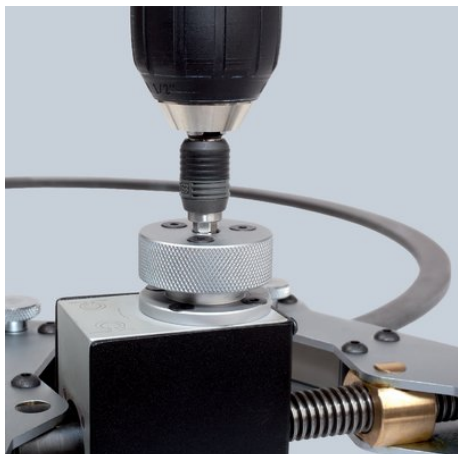
automated or manual operation