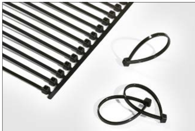
Cable ties for Autotool 2000 systems.