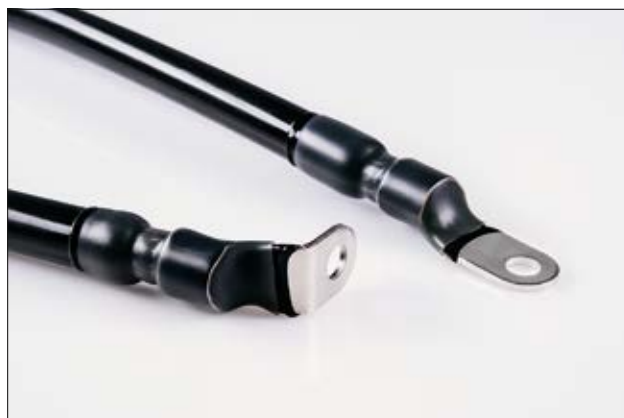
Heat shrink tubing SA47-LA for cable connection.

Cut lengths available on request. Please contact us!