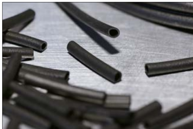
H rubber tubing is highly flexible and easy to apply.