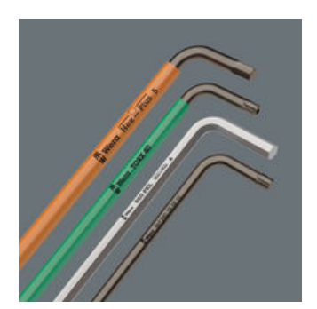
The size of each L-keys has been engraved by a laser. In addition Take it easy L-keys have a colour coding according to sizes — for simple and rapid accessing of the required tool. Making it easy to find the right tool.