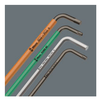
The size of each L-keys has been engraved by a laser. In addition Take it easy L-keys have a colour coding according to sizes — for simple and rapid accessing of the required tool. Making it easy to find the right tool.