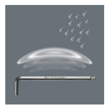
Chrome-plated hexagon L-keys for outstanding surface protection and long service life. High corrosion protection.