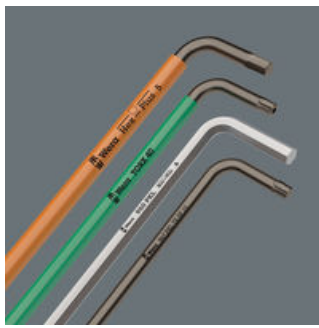
The size of each L-keys has been engraved by a laser. In addition Take it easy L-keys have a colour coding according to sizes — for simple and rapid accessing of the required tool. Making it easy to find the right tool.