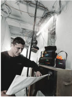
Wera 2go 4 Tool Quiver