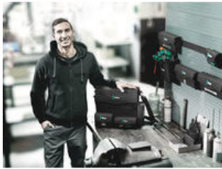
Wera 2go 2 – The outside and inside packer