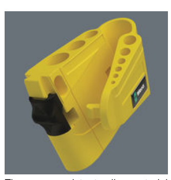
The wear-resistant clip material ensures that the L-keys are securely held yet are easy to remove.

Wera - 950/9 Hex-Plus Imperial 1 SB SiS 05133180001 - 4013288154118