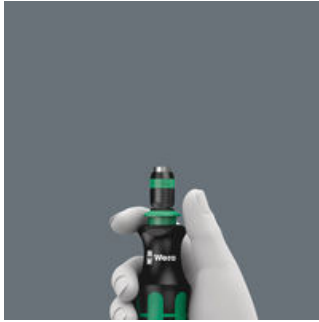
The telescopic blade I

When the unique telescopic blade is lowered into the handle, fast, easy screw-driving action is possible, even in the tightest spots!