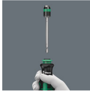
The telescopic blade III

If the clamping sleeve is pushed again the telescopic blade can be taken out of the handle, and be used as a machine bit adaptor.