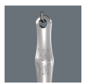
Thanks to its hole the Joker can be neatly hung on the workshop wall.