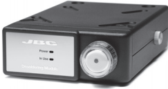
MV-A PNEUMATIC SUCTION MODULE