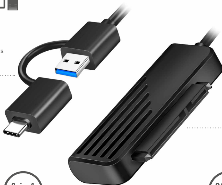
..... 20 cm cable