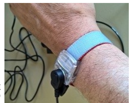
ESD "ONE TOUCH" ADJUSTABLE WRISTBAND