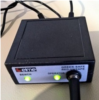
X-1B-1M front and rear with connections of power supply, ground cord, wristband and workstation.