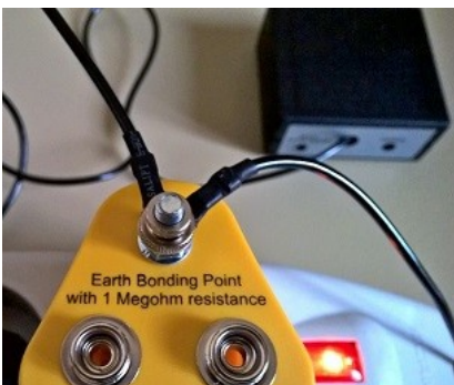
ESD COMMON POINT TO GROUND FOR ESD MAT AND MONITOR

NOTE: for the correct work of the X-1B-1M it is needed to check that all connections are firm and stable, that the grounding of the working place is good and that the wristband is making a good contact on the skin of the operator