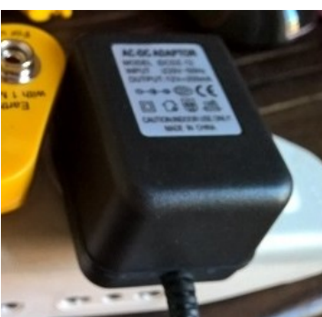
ESD MONITOR POWER SUPPLY