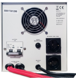
SinusPRO E 2200 12V