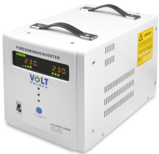
SinusPRO E 2200 12V