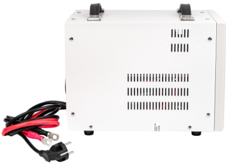
SinusPRO E 2200 12V