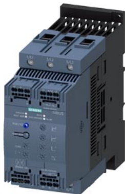
SIRIUS soft starter S3 106 A, 75 kW/500 V, 40 °C 400-600 V AC, 110-230 V AC/DC spring-type terminals