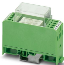
Relay module, with soldered-in miniature switching relay, contact (AgNi+Au): small to large loads, 1 changeover contact, input voltage 24 V AC/DC

Please be informed that the data shown in this PDF document is generated from our online catalog. Please find the complete data in the user documentation. Our general terms of use for downloads are valid.