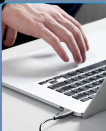
PC without LAN interface