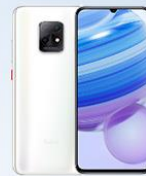
Xiaomi 10 10 Pro