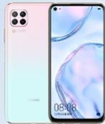
Huawei P40 P40 Pro