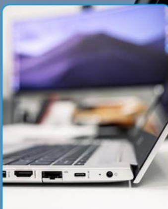
Network card damage