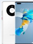
Huawei Mate30 Mate30 Pro