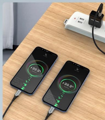
USB-C Two mobile phones