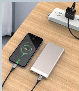
USB-C Phone/power bank