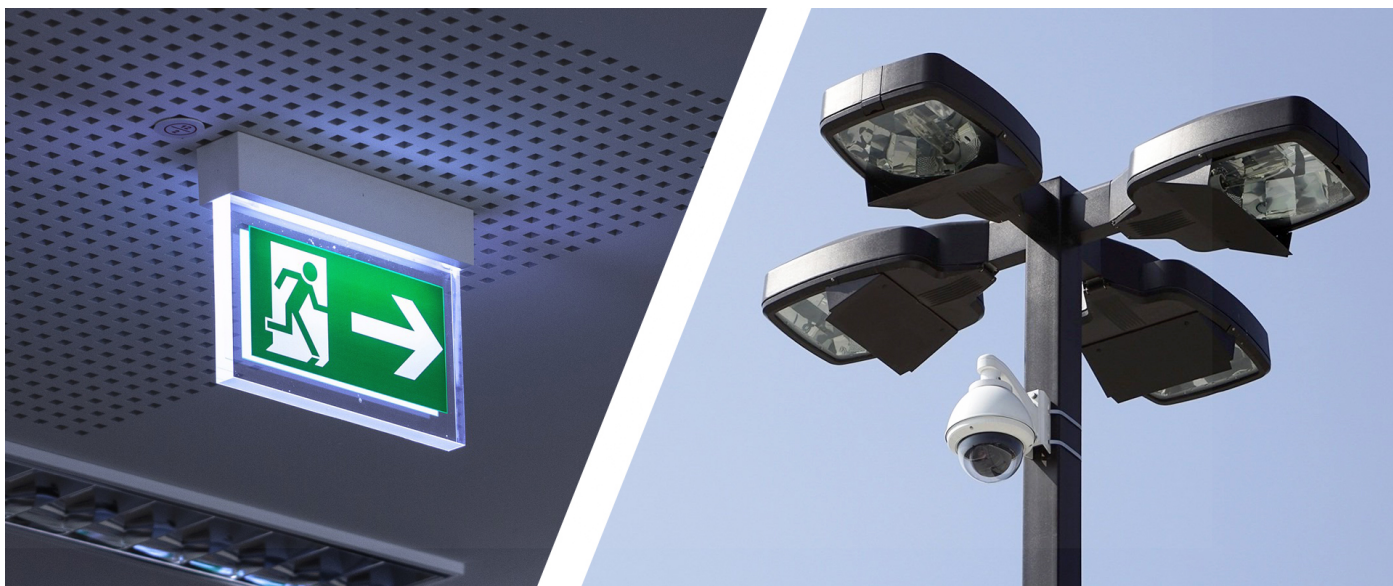
Buffer applications, as emergency power supply: UPS, central heating furnaces, alarm systems, emergency lighting, medical equipment