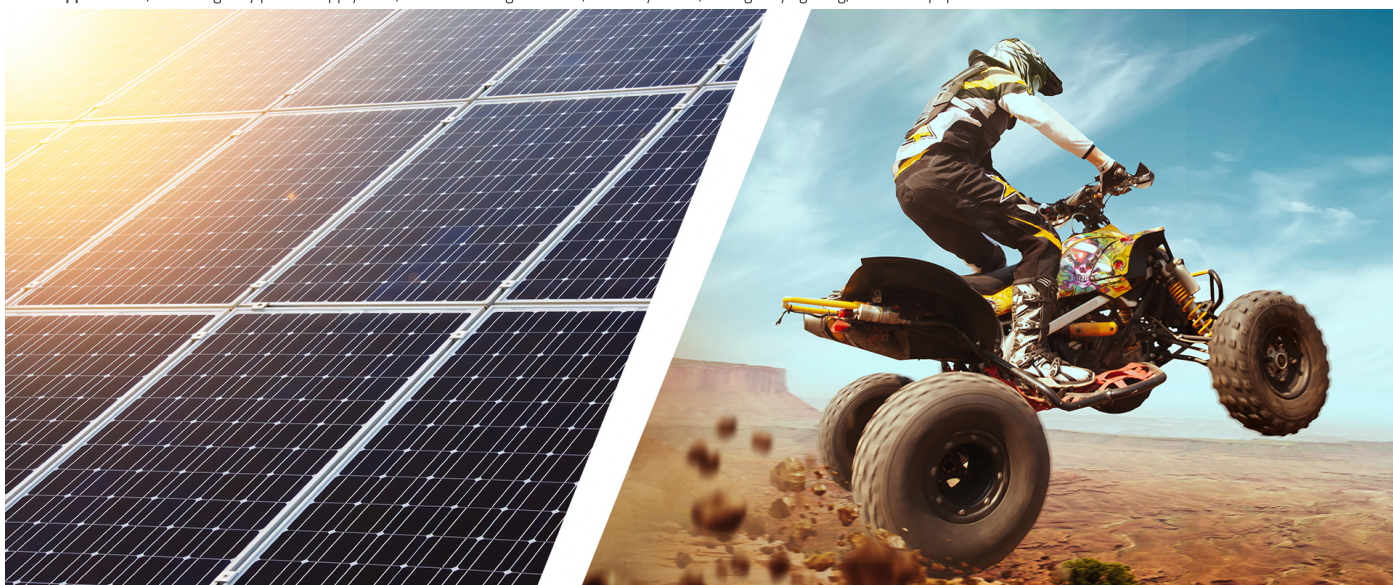
Cyclic applications, as a stand-alone power source: Yachts, campers, golf carts, solar installations