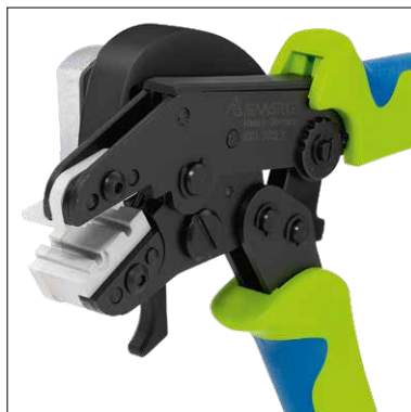
Art. No. 8001 0002 3