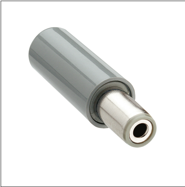
Power supply plug, straight version, with solder eyes