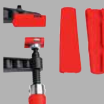
Pressure cap strips SKS (2 pcs./bag)