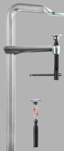
Original BESSEY all-steel screw clamp GZ with tommy bar