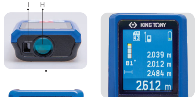
• Color LCD