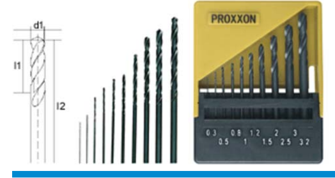
NO 28 874