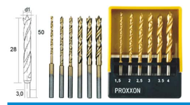
NO 28 876

10-piece set. Similar to DIN 338. \emptyset 0.3 - 0.5 - 0.8 - 1 - 1.2 - 1.5 - 2 - 2.5 - 3 - 3.2mm. For drilling non-ferrous metal, steel and stainless steel. In labelled cassette with fold back and stand function. For clamping we recommend our 3-jaw drill chuck. Rotational speed see table.