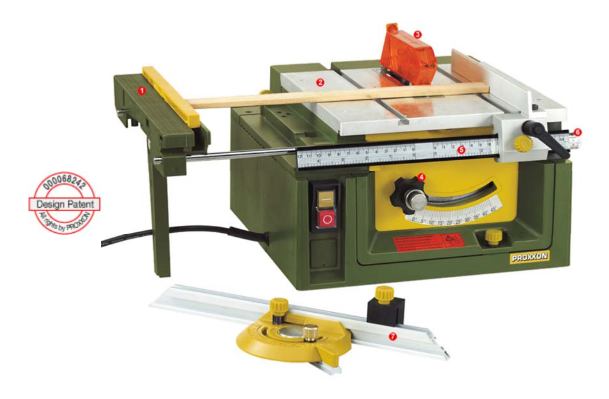
Table saw FET