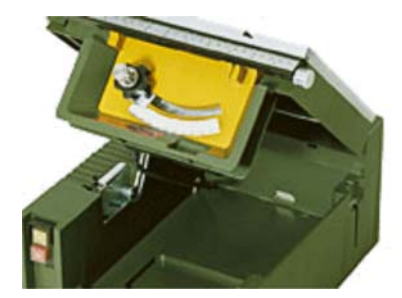
Table and drive can be lifted up and supported like an engine bonnet. For cleaning the device and easy saw blade replacement.

Non-slotted sawing cap cover of ABS for tight tolerances between saw blade and table (is slotted from below by the FET saw blade). For cutting very small parts.