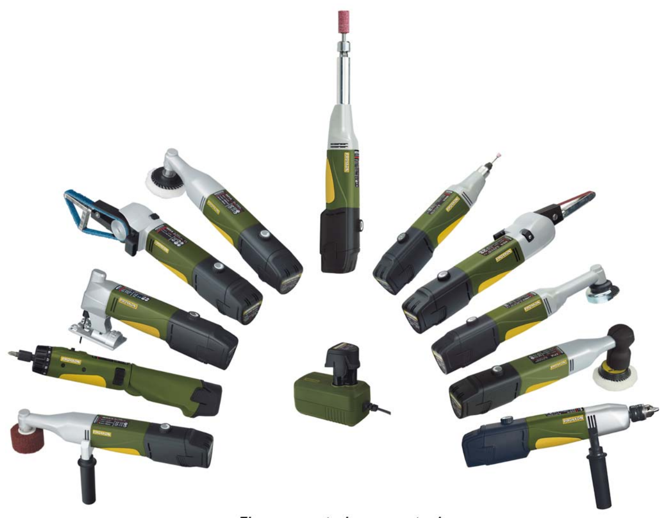
Eleven power tools - one system!

One battery and one rapid charger only for now already eleven professional tools: