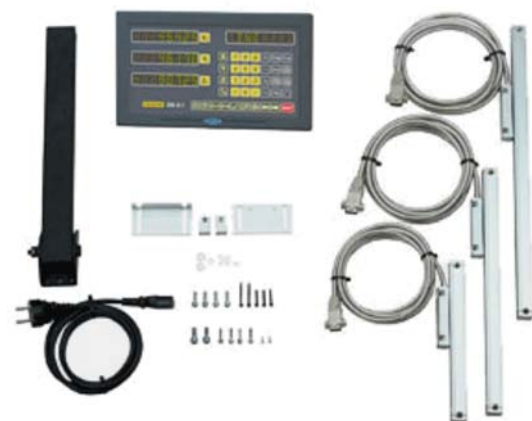
Digital position indicator DA 3.1 Mounting kit