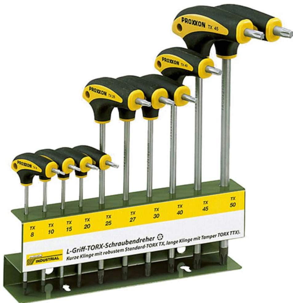
NO 22 652 10-piece L-handle TX set with holder