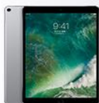
USB-C tablet iPad Pro, etc.

Applicable for devices with USB-C interface