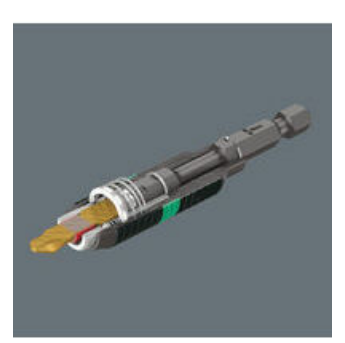
The effectiveness of the BiTorsion system comes from a combination of two shock-absorbing spring elements. Both bits as well as holders have a cushioning torsion zone that diverts the kinetic energy away from the drive tip during peak loads.