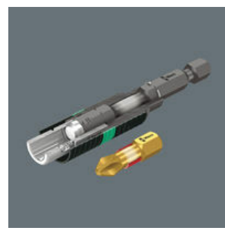
The optimally coordinated features of the torsion zones on the bit and holder permit a phased yield when under strain. The two-phase system prevents premature wear. Moreover, a long tool service life is also ensured by the hardness of the bits that matches the respective application.