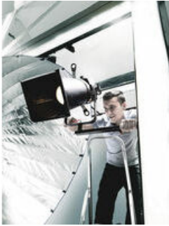
L-key for TORX® socket screws with safety pin