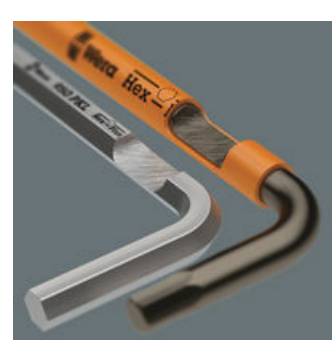
L-keys made from circular material fit into the hand better and allow less strenuous work over a longer period. Additionally, the rubber sleeve provides a pleasant grip, particularly in applications at low temperatures. Colour coding and large stamp enable the desired Lkey to be easily located. Moreover, the round material keys are more robust, particularly where smaller sizes are concerned.