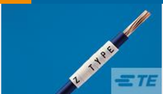
TE Part #EC1218-000 06201000