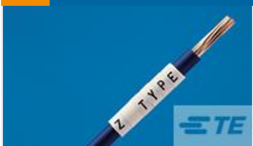
TE Part #EC1220-000 06201202