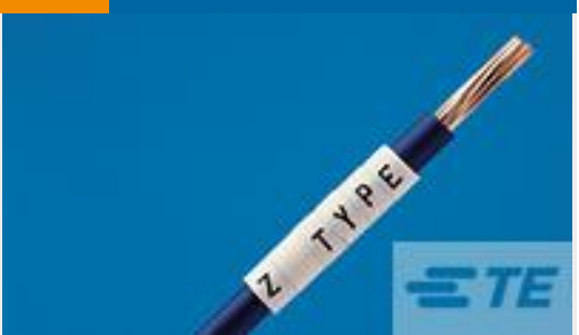
TE Part #EC1219-000 06201101