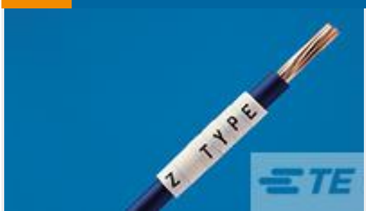
TE Part #EC1225-000 06201707