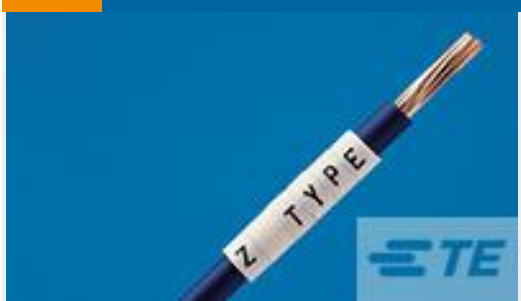
TE Part #EC1221-000 06201303