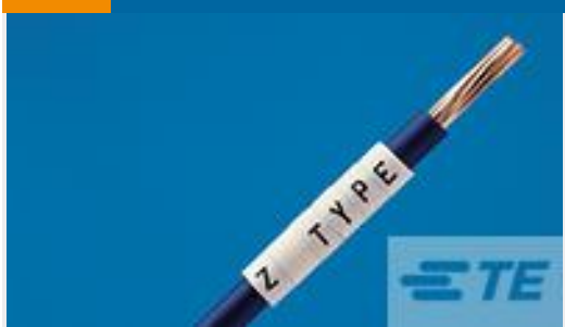
TE Part #EC1224-000 06201606