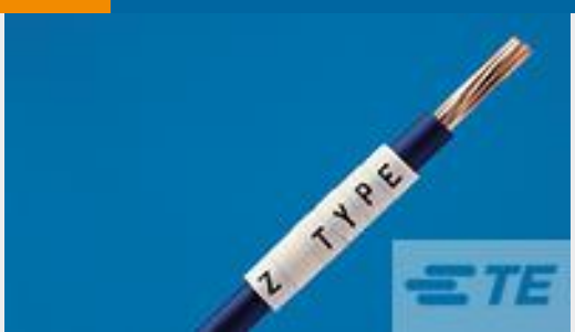
TE Part #EC1226-000 06201808