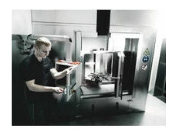
The individual testing at 10,000 volts, in accordance with IEC 60900, ensures safe working with loads up to 1,000 volts.