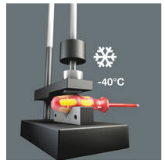
Impact strength tested at -40^{\circ} C, guaranteeing safety even under extreme conditions.