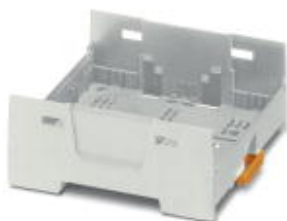
Component housing, color: gray, width: 67.5 mm

Please be informed that the data shown in this PDF Document is generated from our Online Catalog. Please find the complete data in the user's documentation. Our General Terms of Use for Downloads are valid ( http://phoenixcontact.com/download )