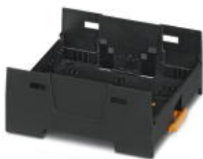
Component housing, color: black, width: 67.5 mm

Please be informed that the data shown in this PDF Document is generated from our Online Catalog. Please find the complete data in the user's documentation. Our General Terms of Use for Downloads are valid ( http://phoenixcontact.com/download )