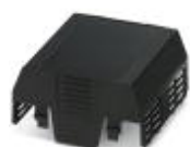
Component housing, without connection opening, Upper part, color: black, width: 67.5 mm

Housing cover - EH 67,5 F-C CS/ABS BK9005 - 2201775