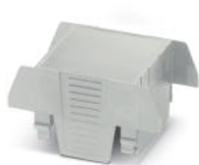
Component housing, connection opening on both sides, Upper part, color: gray, width: 45 mm

Please be informed that the data shown in this PDF Document is generated from our Online Catalog. Please find the complete data in the user's documentation. Our General Terms of Use for Downloads are valid ( http://phoenixcontact.com/download )