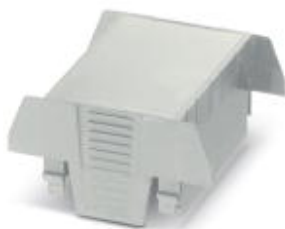
Component housing, connection opening on both sides, Upper part, color: gray, width: 67.5 mm

Please be informed that the data shown in this PDF Document is generated from our Online Catalog. Please find the complete data in the user's documentation. Our General Terms of Use for Downloads are valid ( http://phoenixcontact.com/download )