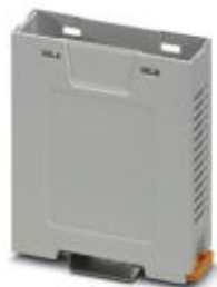
Component housing, color: gray, width: 22.5 mm

Please be informed that the data shown in this PDF Document is generated from our Online Catalog. Please find the complete data in the user's documentation. Our General Terms of Use for Downloads are valid ( http://phoenixcontact.com/download )